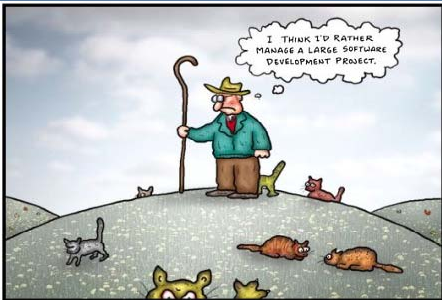
The daydreams of cat herders